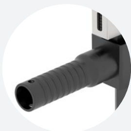
Port Guard Handle