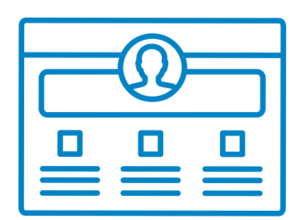
Nord-Lock Portal or Nord-Lock API