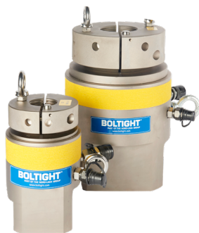
Boltight standard subsea tensioning tools

Time savings and reduced repair time due to double acting bolt tensioning method delivered.